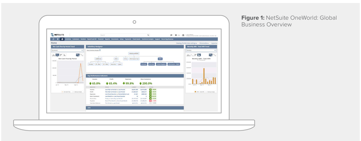
Figure 1: NetSuite OneWorld: Global Business Overview

NetSuite OneWorld is built around robust financial reporting capabilities that enable an organization to understand what is happening across the global business in real-time. In addition, NetSuite OneWorld provides a multi-language user-interface that helps bridge communication barriers and provides a flexible hierarchy that allows businesses to run their entire entity structure with ease. OneWorld is designed to provide an instant global view of