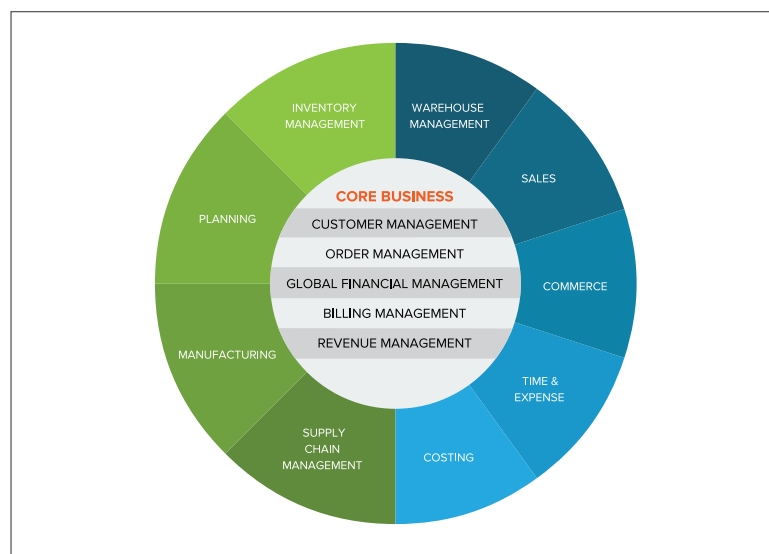
Figure 1: NetSuite provides a full business solution for manufacturers.

Since it’s a cloud-based application, manufacturers can benefit from NetSuite’s rich functionality immediately, and at lower upfront costs, than legacy approaches.